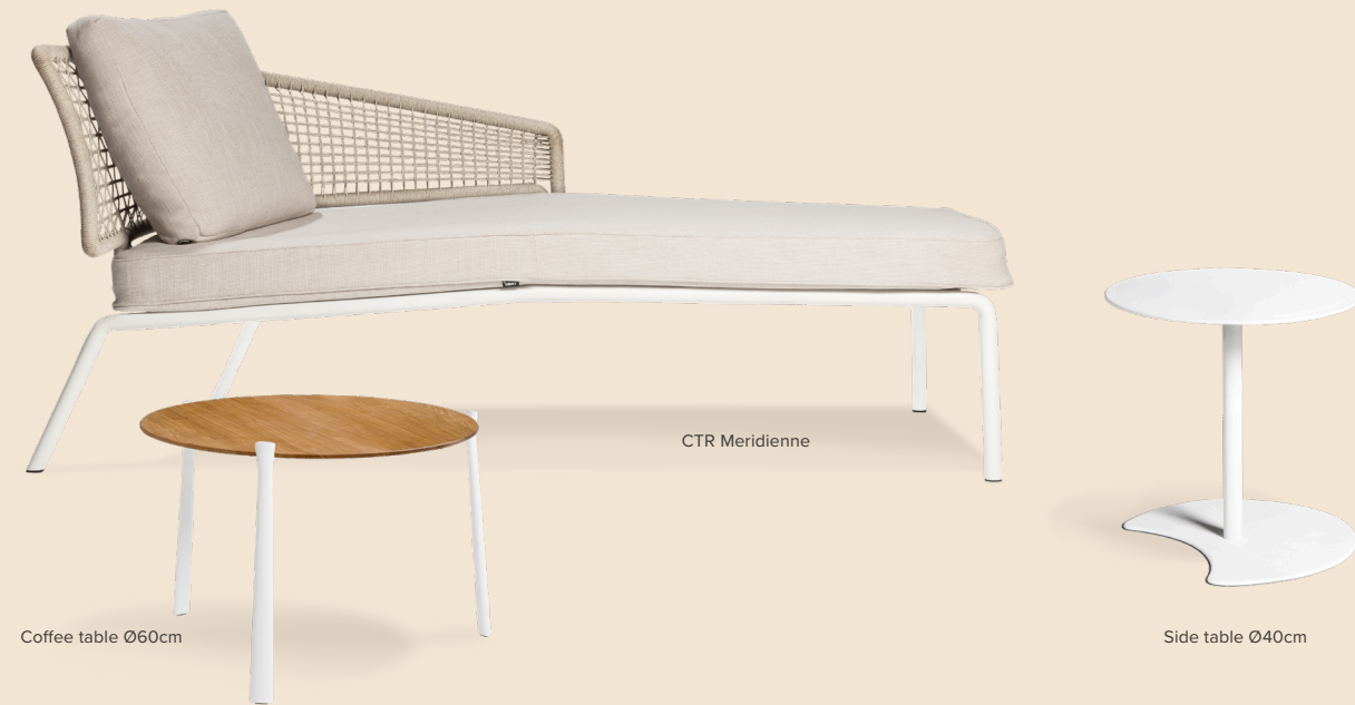
Coffee table Ø60cm

A round coffee table with top in Indonesian plantation teak and a side table in white aluminium complement the whole.