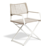
Regista armchair 8x

The Illum table, designed by Marc Merckx and Pieter Maes, has a width of 71cm which enhances the intimate feeling at family & friends dinners. The table with slender legs in powdercoated aluminium is kept pure and simple. The top in white ceramic is glued on glass, which enhances the solidity. The combination with the eight Regista armchairs with a white frame and linen seat and weave, gives the whole a pure and fresh look