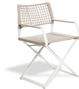
Regista armchair 3x